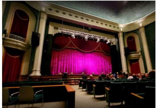
SALT LAKE COMMUNITY COLLEGE SOUTH CITY CAMPUS